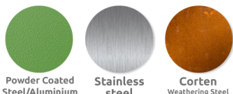
Powder Coated Steel/Aluminium Stainless steel Corten Weathering Steel

Available in the options below; for further details visit our materiality page >>