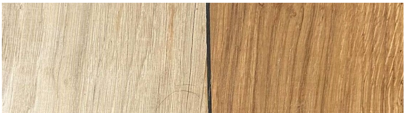
Natural vs. Oiled Oak

By requesting a clear oil, or even UV protective surface treatment on your oak products, staining, tannin-leeching and adverse seasonal movement can be minimised. Applying an oil finish will also bring out the rich colours of the oak timber and improve its visual quality, however oil must be periodically reapplied to maintain a good finish.